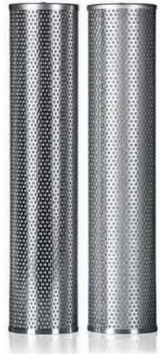
SAMPLE LUBE OIL AND LIQUID FUEL FILTERS