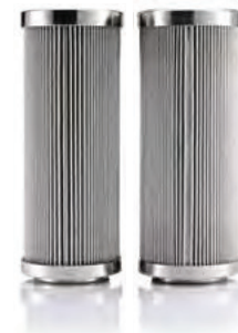
SAMPLE DEMINERALIZED WATER FILTERS