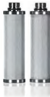
SAMPLE SEAL GAS FILTERS